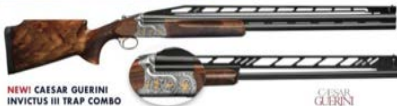
NEW! CAESAR GUERINI INVICTUS III TRAP COMBO